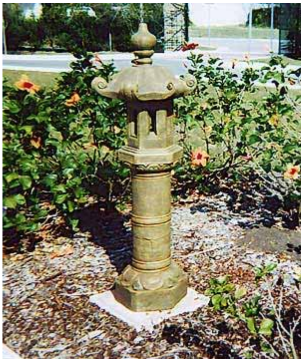
Golby-Reasoner Chapter gifted this Japanese Lantern to Palma Sola Botanical Park.